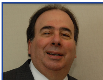
Thank You John Carlos